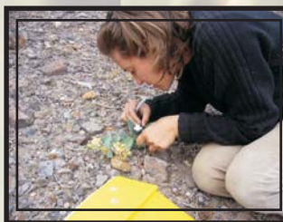
Botanical Material Collection & Sampling for Lab Analysis Sensitive Plant Species Research & Consultation with UNR Herbarium Faculty