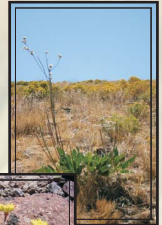
Baseline Botanical Surveys