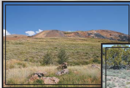
Reclamation Release Criteria Vegetation Surveys as Required by Nevada & California Agencies