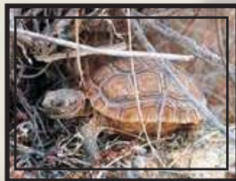
Special Status Species Surveys for Desert Tortoise, Pygmy Rabbits, Greater Sage-Grouse, Raptors, and Bats