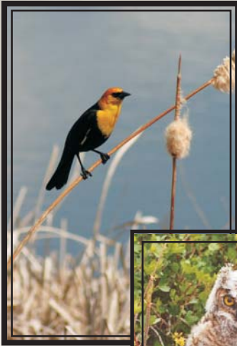
Migratory Bird Nesting Surveys