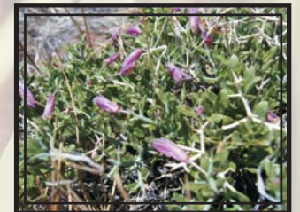
Noxious Weed and Invasive Species Surveys & Noxious Weed Removal, Mitigation & Risk Assessment