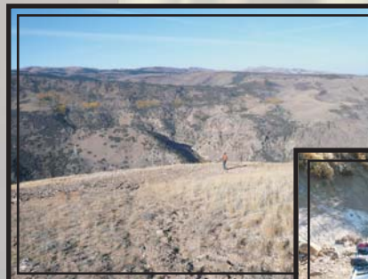
Reclamation Reseeding Services