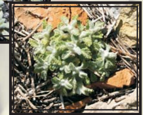
Sensitive Species Plant Surveys Vegetation Community Mapping